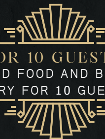
TABLE FOR 10 GUESTS $6,000 UNLIMITED FOOD AND BEVERAGE ENTRY FOR 10 GUESTS

TO INQUIRE OR PURCHASE A TABLE OR SPONSORSHIP PLEASE CONTACT BRENT HOUGH