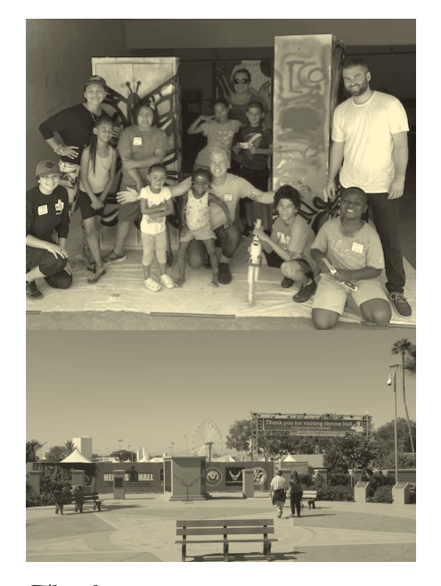
Thanks to your generous support, over 4,500 homeless, hungry people have found help at our Orange County Courtyard during the past year.