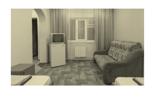
Our HomeLight Program provides fully furnished apartments, community and computer rooms, recreational areas, a library, plus a large outdoor playground and basketball court.

During the 2018-2019 fiscal year, our HomeLight program helped 57 families, served 35 children with programs and summer camp experiences, and found jobs for 19 people.